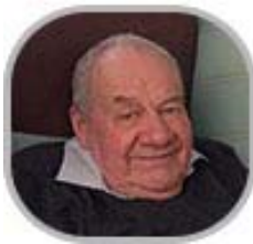
Ronald W. P. Drever