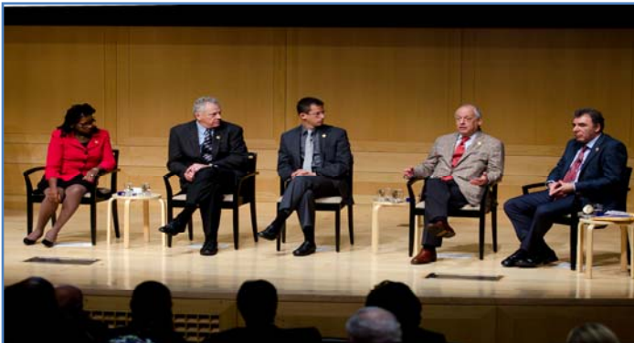
2011 Justice Prize recipients during panel discussion